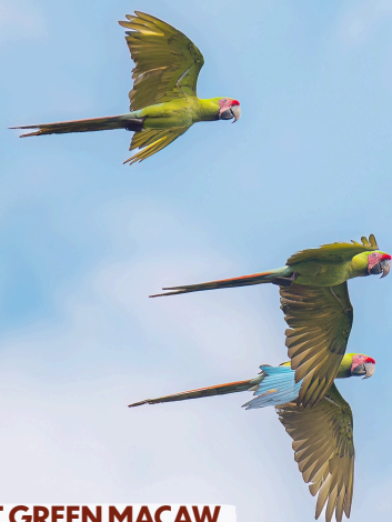
GREAT GREEN MACAW

Although Costa Rica is a relatively small country, it lies within a bird-rich neotropical region, boasting an extraordinary number of bird species for its size. To date, 936 bird species have been recorded in Costa Rica, including 7 endemic species and 20 globally threatened species. With an area of only 51,100 km 2 —smaller than the state of West Virginia—Costa Rica holds the highest density of bird species of any continental American country, making it a true paradise for bird enthusiasts and nature lovers alike. This remarkable biodiversity is a testament to the country's diverse ecosystems, ranging from cloud forests and rainforests to coastal wetlands and high-altitude paramo regions.