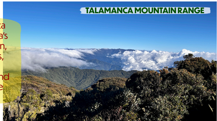
TALAMANCA MOUNTAIN RANGE